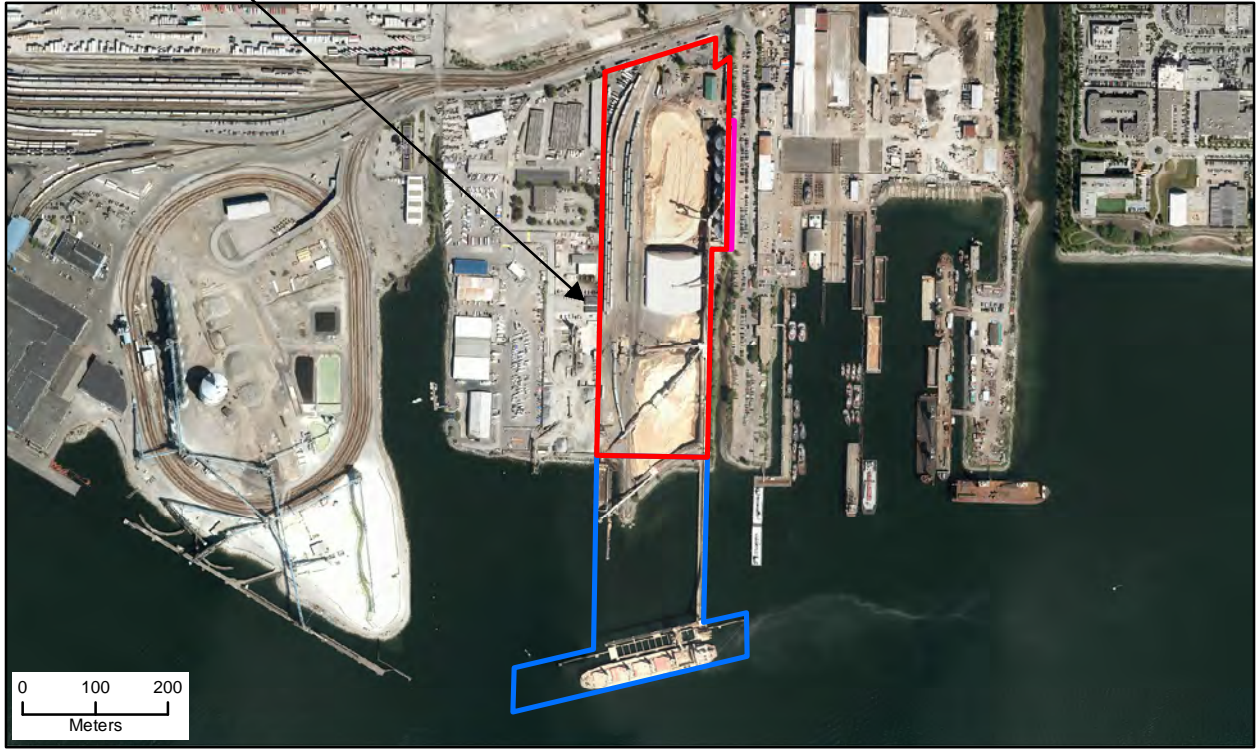
Aerial View 1:8,500